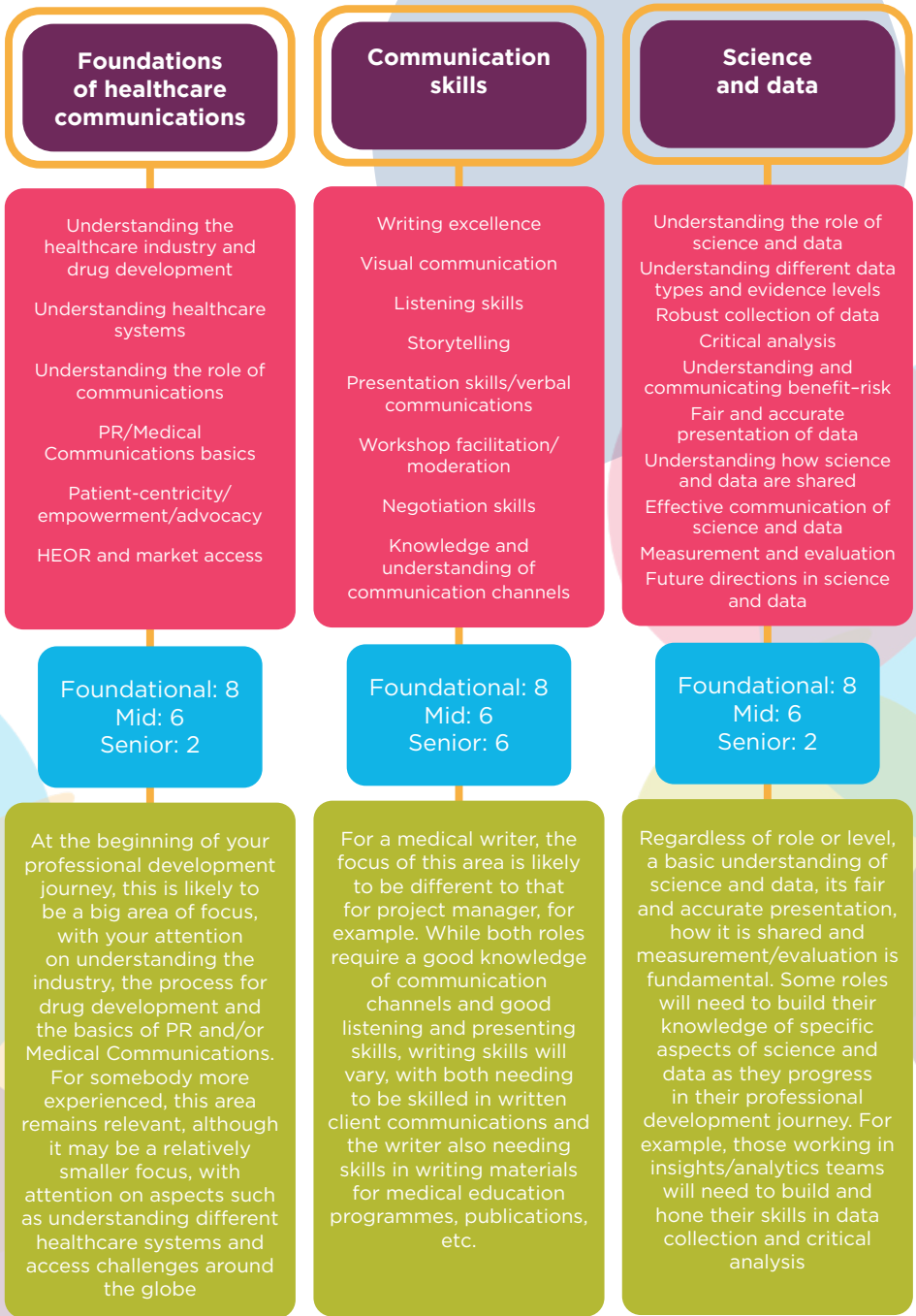
Figure 2. HCA core competency framework